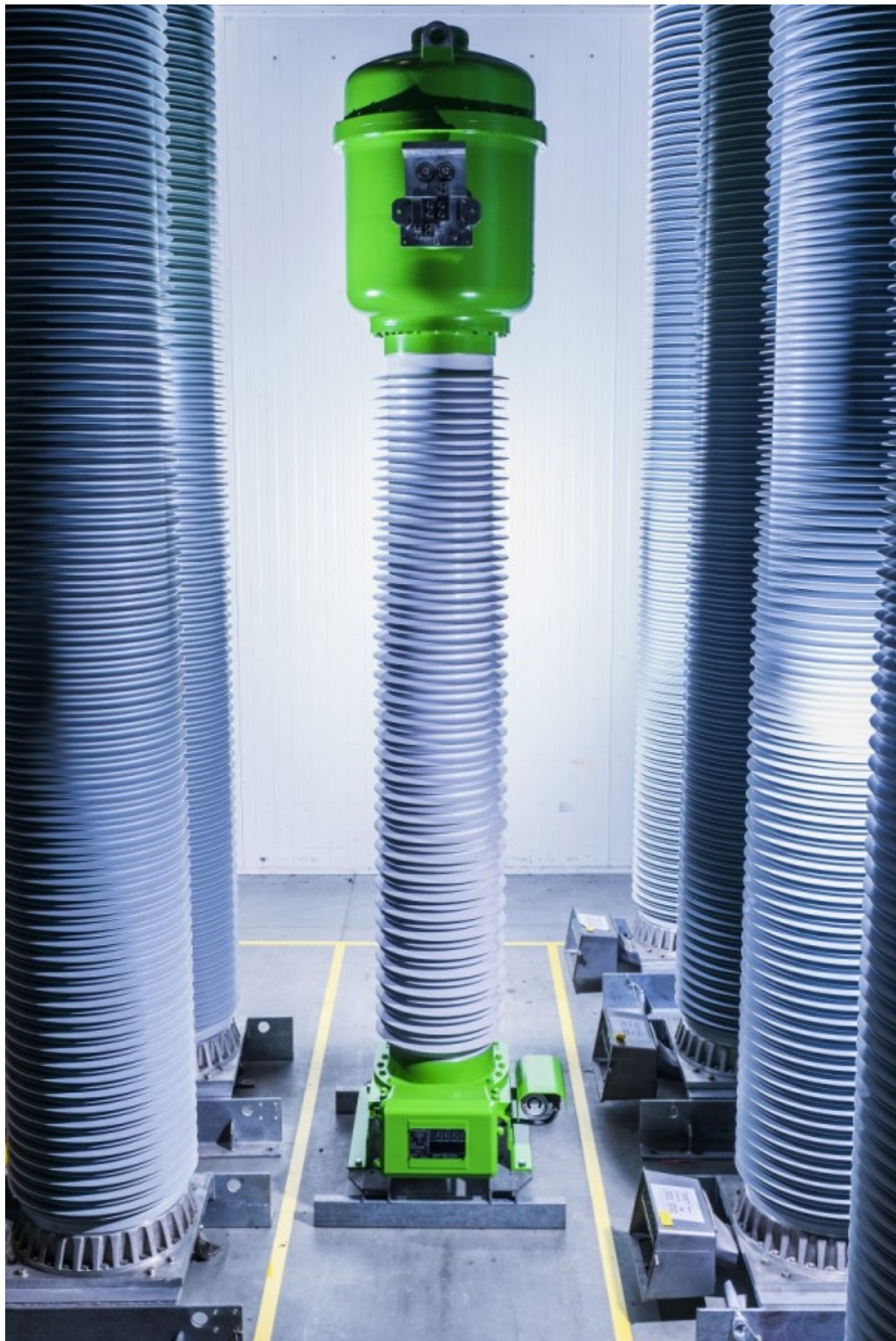
245 kV g^3 -insulated current transformer