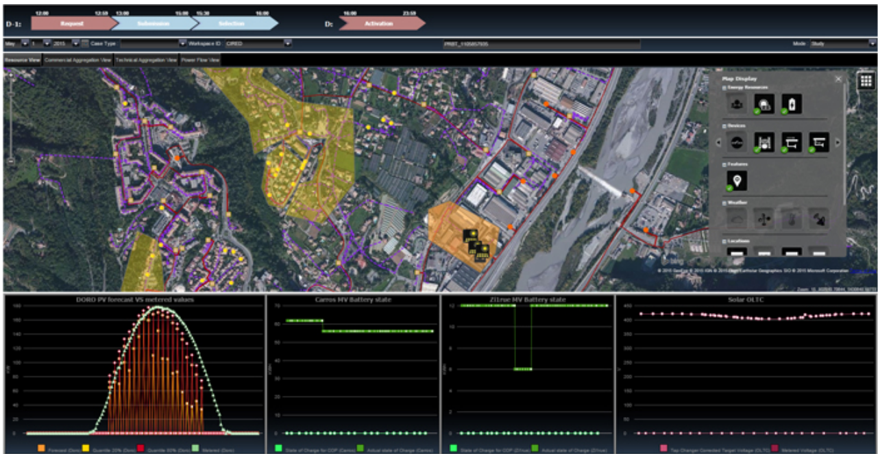
Typical dashboard for managing multiple microgrids

Nice Grid is due to run until January 2016, but a number of lessons can be drawn already. For Muscholl, perhaps the most important one is that: “focus on energy-centric services and related business and data models is only part of it. The active participation of numerous end-users also required deeper insights into the commercial, societal, legal and regulatory constraints.”