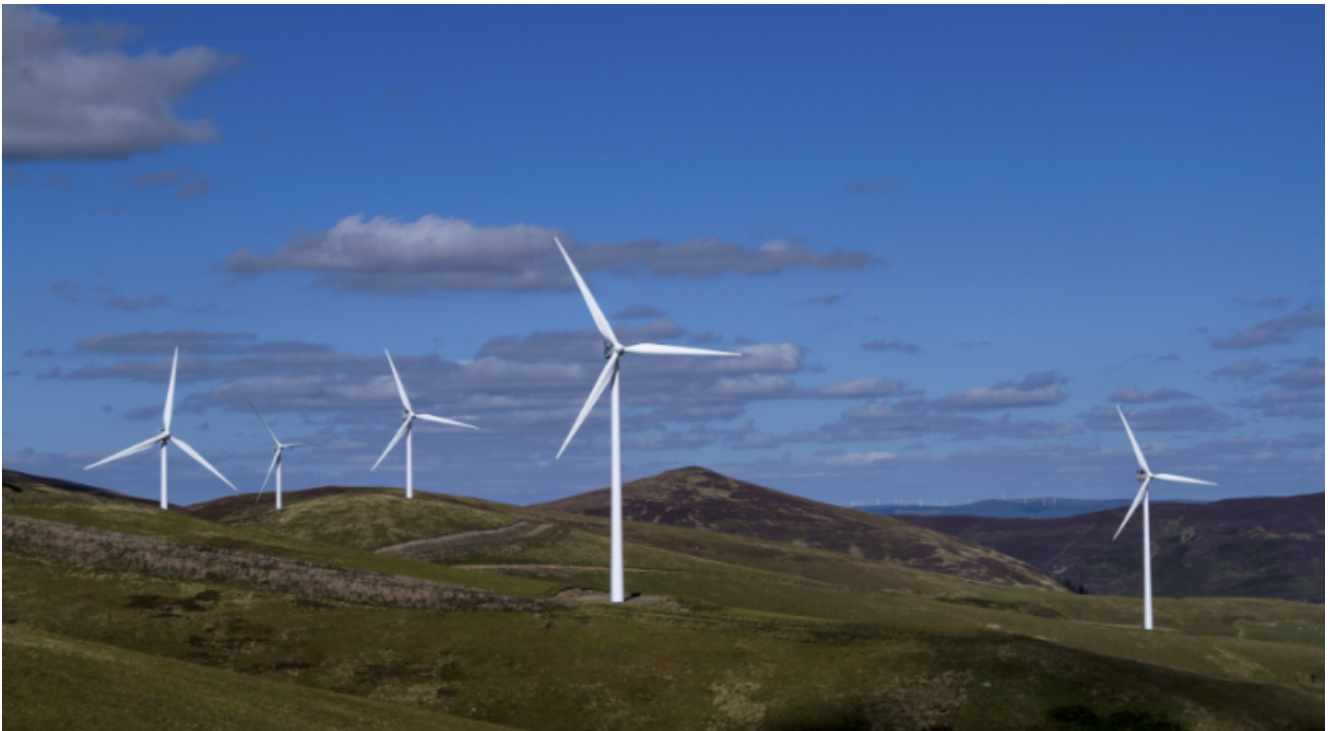
Wind farm in the Scottish Borders

In 2009, the UK government set a legally binding target to obtain 15% of the country's energy consumption from renewable sources by 2020, up from 3% when it adopted the EU Renewable Energy Directive. Planners have already given permission for 35 GW of renewable electricity capacity, enough to meet the required 110 TWh contribution from electricity towards the target, with 1 TWh to spare.