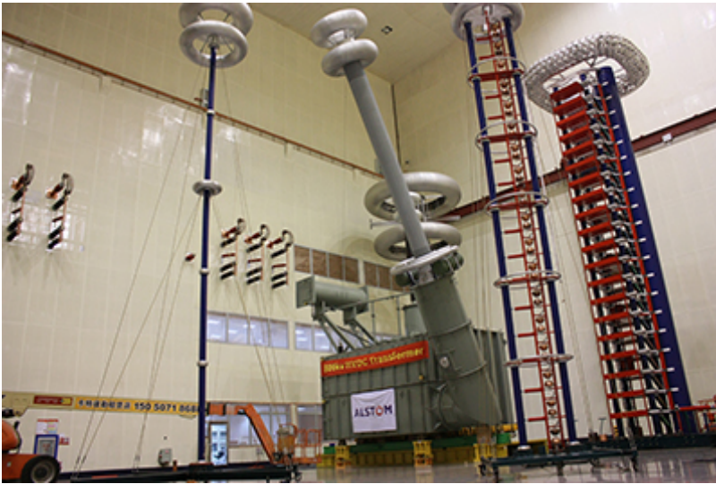
GE Renewable Energy's Grid Solutions - 800_kVDC bushing being tested in Graz, Austria

are needed to control voltage distribution when the bushing is in the transformer turret.